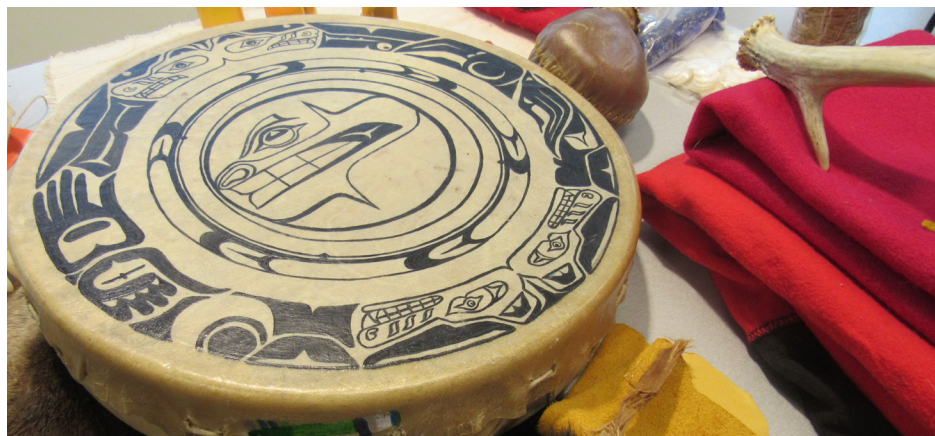
Harvest Full Moon Festival by artist Marina Szijarto, City Centre Community Centre, 2015.