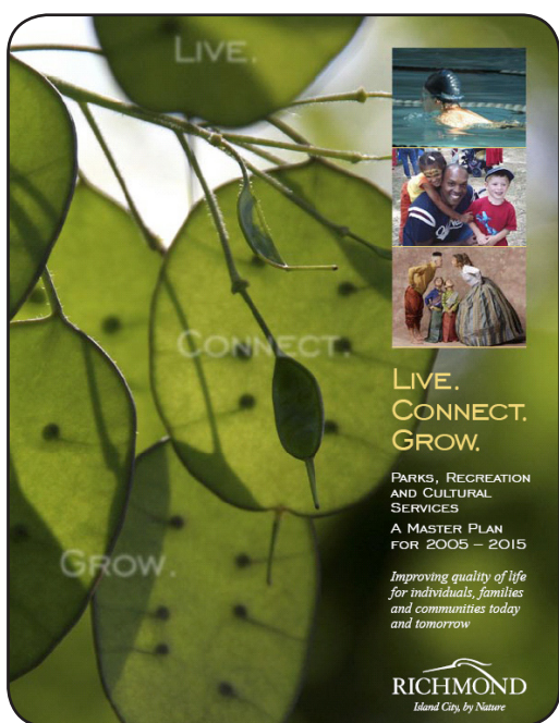
“Richmond! Striving for a connected, healthy city where we cooperate to create and enjoy.”

Field sports provide many social benefits to a community. It provides an opportunity for participants and their families to meet and socialize with others in the community. Children, youth and adults meet people of other races and cultures and