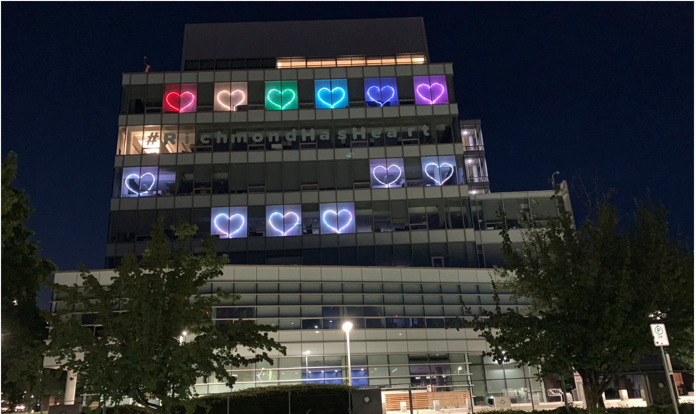
Richmond City Hall lit up with Rainbow Hearts in celebration of Pride Week as a part of the #RichmondHasHeart Campaign.

The Social Development Strategy (2013–2022) continues to be an effective roadmap to guide the City in achieving its vision to be the most appealing, livable and well-managed community in Canada. The collaborative efforts of the City, community organizations, key stakeholders, and Richmond residents is essential to address the increasingly complex social challenges faced by our growing city and region. The Strategy remains a valuable asset in providing guidance on priorities and allocation of resources in order to best support the community and improve the overall wellbeing of Richmond residents.