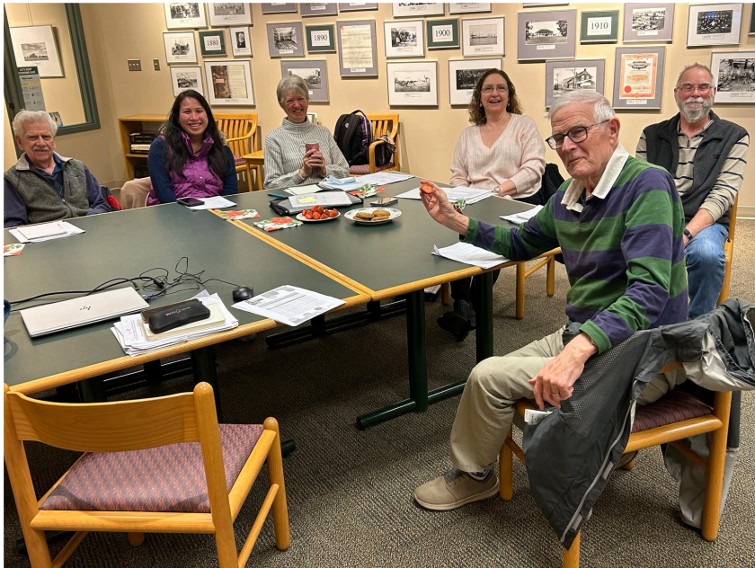
Friends of the Richmond Archives

Volunteers are at the heart of much of the heritage work done across the city. From supporting the delivery of programs and events, championing the conservation of Richmond heritage places and objects, to helping to steward the heritage sites, community members play an integral role in preserving and presenting heritage. In 2022, 540 volunteers contributed over 16,000 hours to the daily operations of museums and heritage sites and in support of a variety of heritage activities.