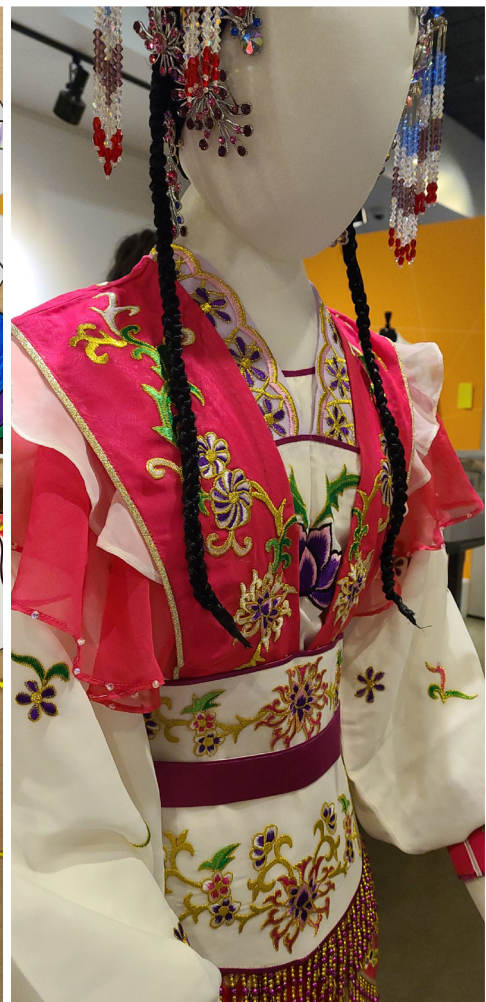
Chinese opera mask making and costume