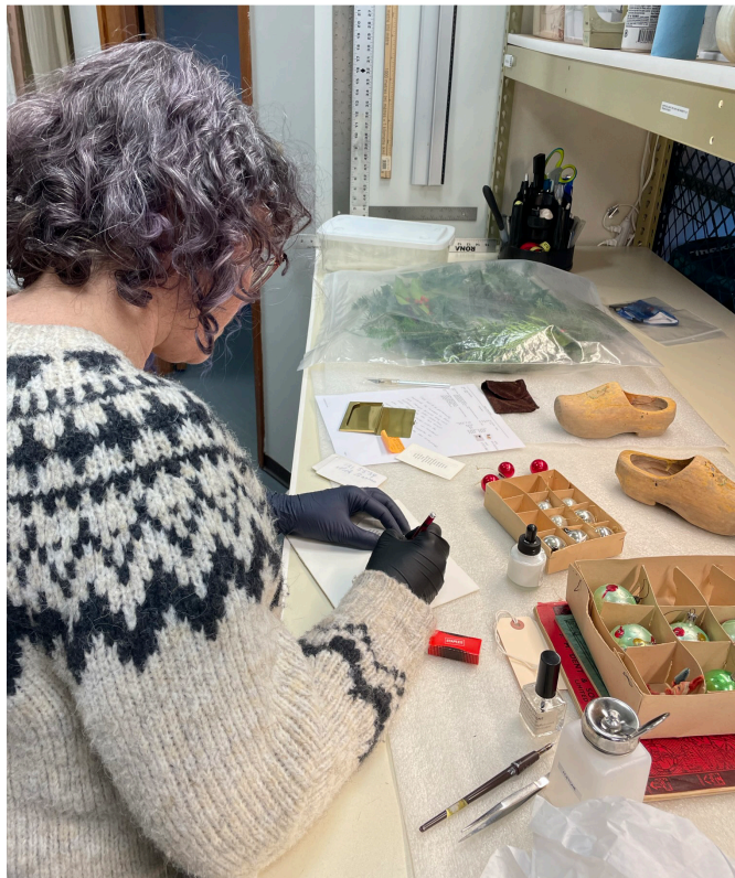
Curatorial Assistant processes new donation

https://www.richmond.ca/culture/sites/artefactcollection.htm