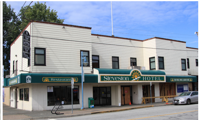
Steveston Hotel, 2018