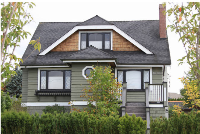
R.G. Ransford House

www.richmond.ca/plandev/planning2/heritage/village-conservation.htm