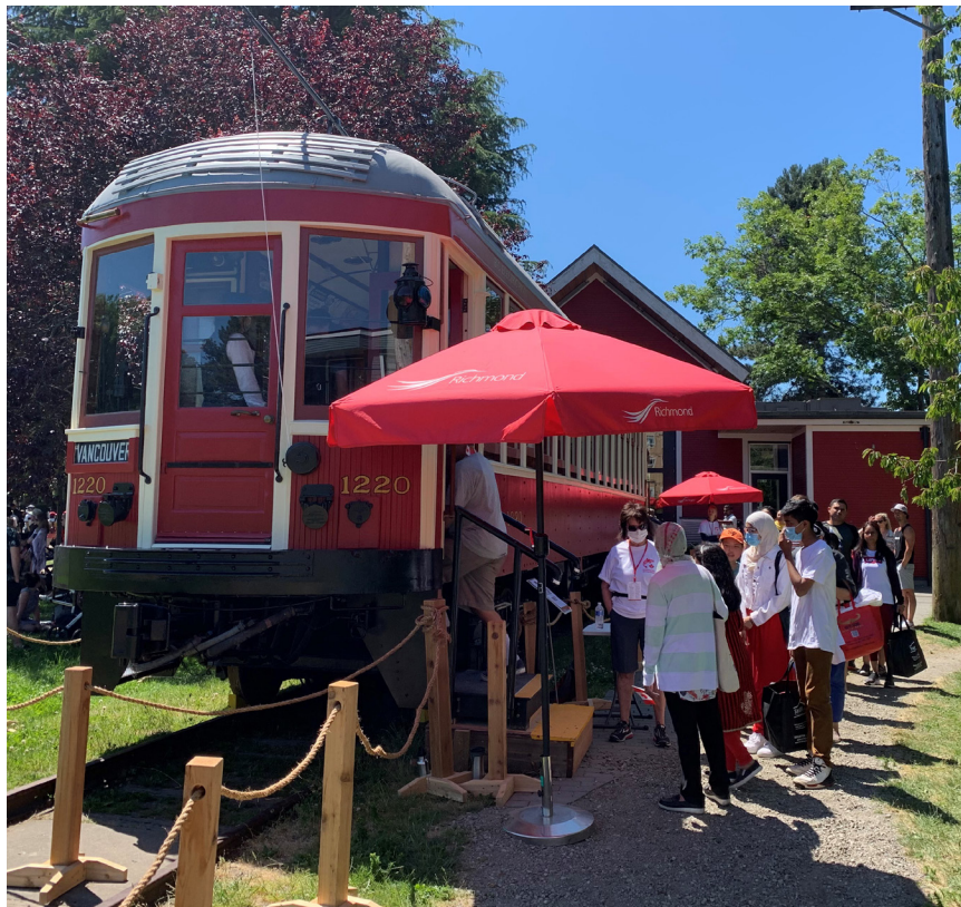
Canada Day Tram, 2022