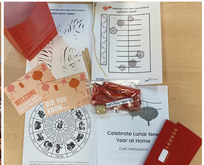
Activity kits for National Indigenous Peoples Day and Lunar New Year