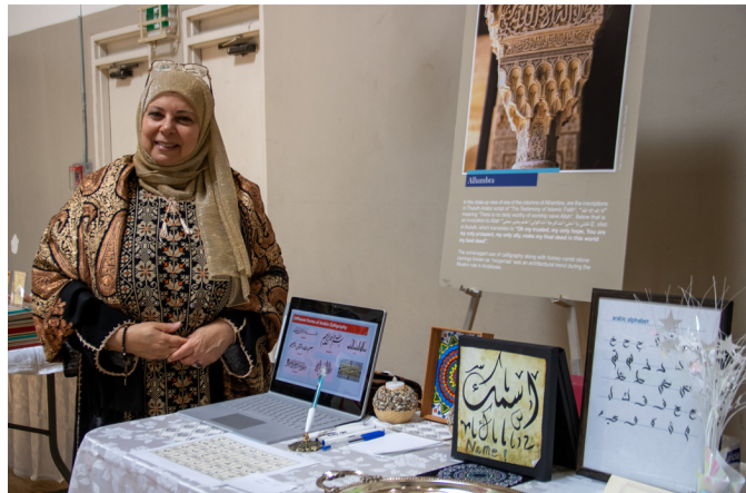
Doors Open, 2022