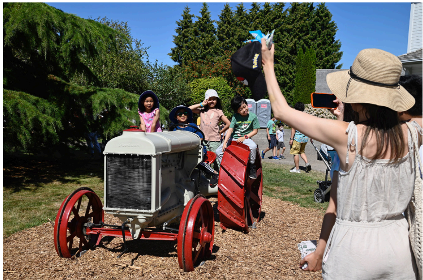
Family Farm Day