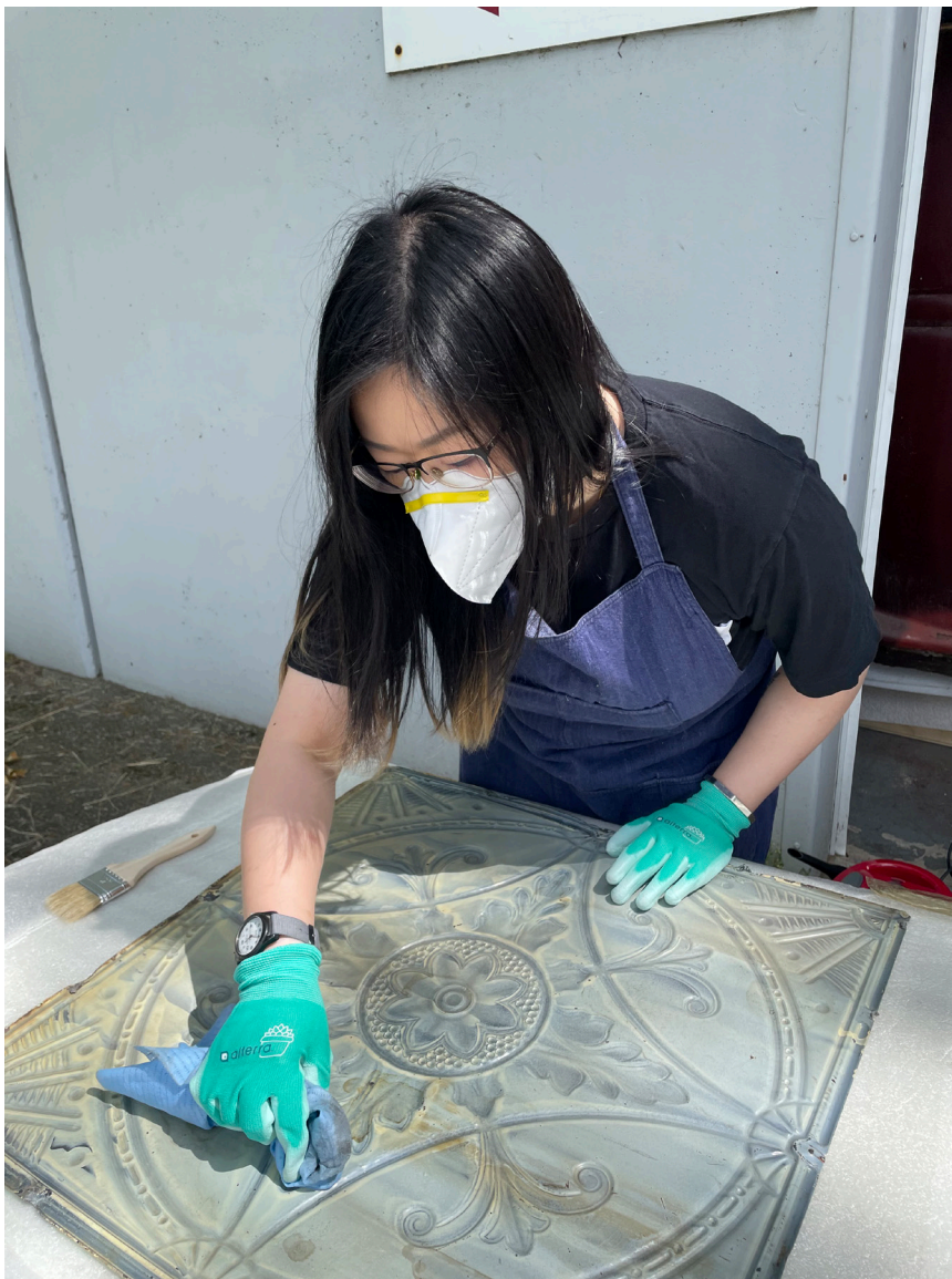
Collections technician cleans tin ceiling tile

423 artifacts, documents and stories were collected in 2022.