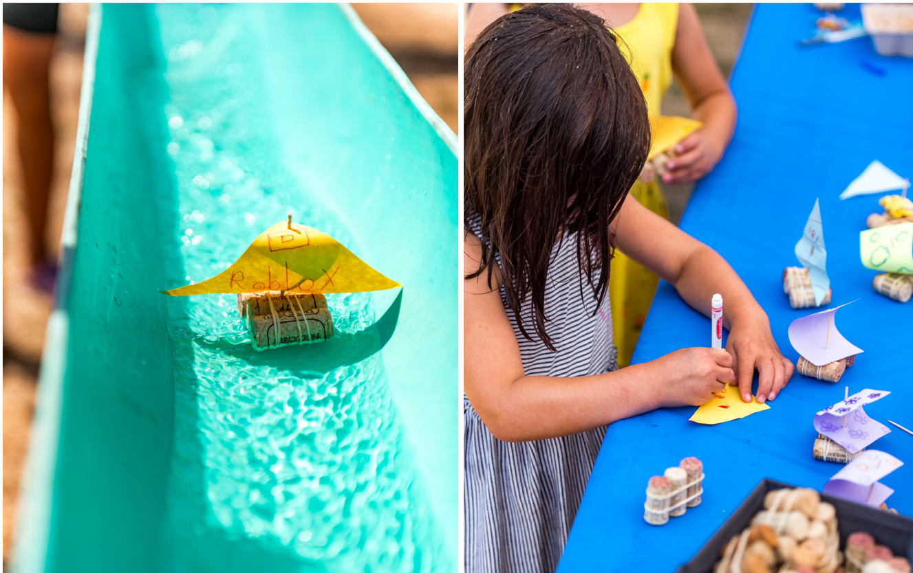
Richmond Maritime Festival cork boat making craft

Fully in person in 2022, Richmond Maritime Festival offered visitors a sample of Steveston heritage through performances of local artists, participation in arts and cultural activities, and tasting delicious cultural cuisine. The Festival highlighted West Coast maritime history with a display of restored wooden boats, handcrafted boat models, and water safety demonstrations. The focus was on family with many opportunities for children to connect with local heritage through sea creature puppet shows, by creating their own cork boats, learning origami, and designing their own boat flag.