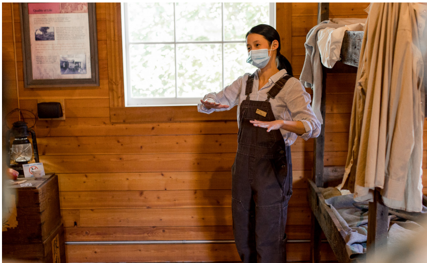
Guided Tour at Britannia