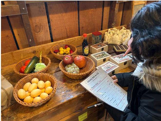
My Community on the Waterfront

In October 2022, Richmond Museum and Britannia Shipyards National Historic Site staff co-presented a full-day professional development workshop for teachers. Teacher participants discovered new ways to bring Richmond history into their classroom and left feeling empowered with more knowledge about the community they teach in.