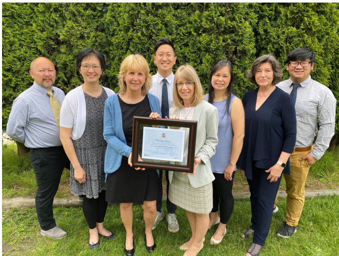
Heritage Fair teachers at Cornerstone Christian Academy

https://www.richmond.ca/plandev/planning2/heritage/heritageawards.htm