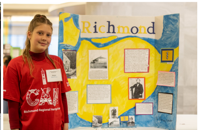
Whiteside Elementary student with project