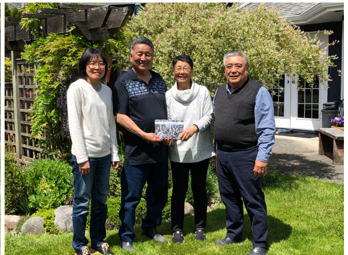
From the Sea and Shore project team