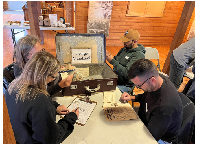
Teacher Pro-D Workshop