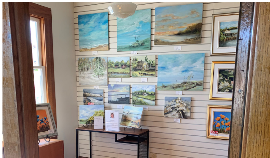
Pop Up Art Show