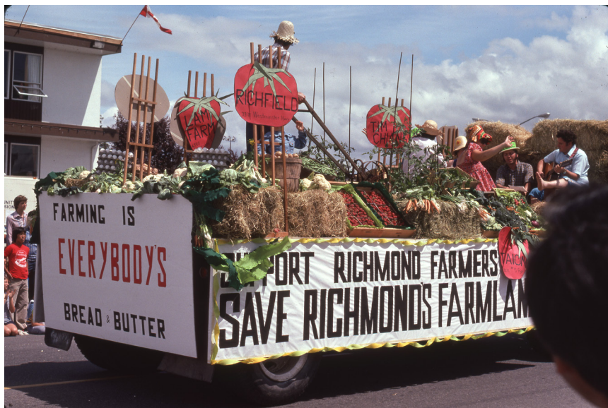
The Save Richmond Farmland float in the 1977 Salmon Festival parade.