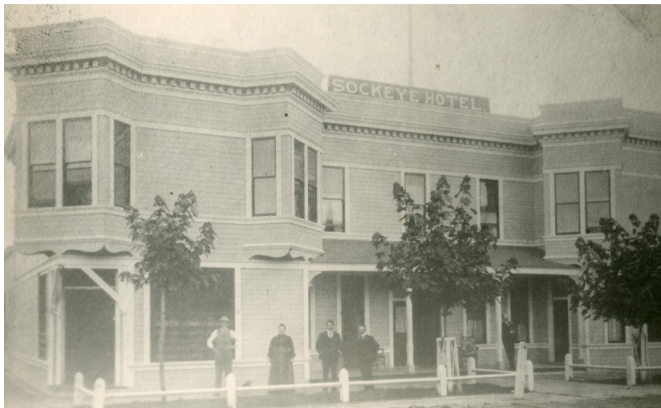
Sockeye Hotel ca. 1910

https://www.richmond.ca/__shared/assets/planning_0330940.pdf