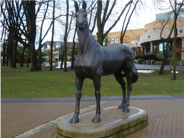
Minoru Horse, Sergei Traschenko, 2010