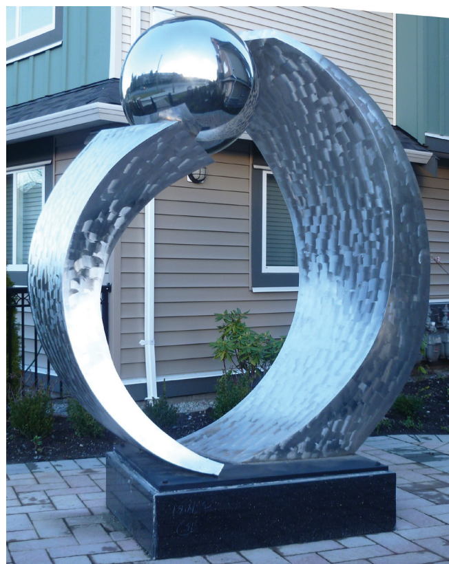
Tsunami in Steel , James Kelsey, 2009

With the continued strong level of construction activity in Richmond, additional private development public art projects are anticipated in 2011–2012.