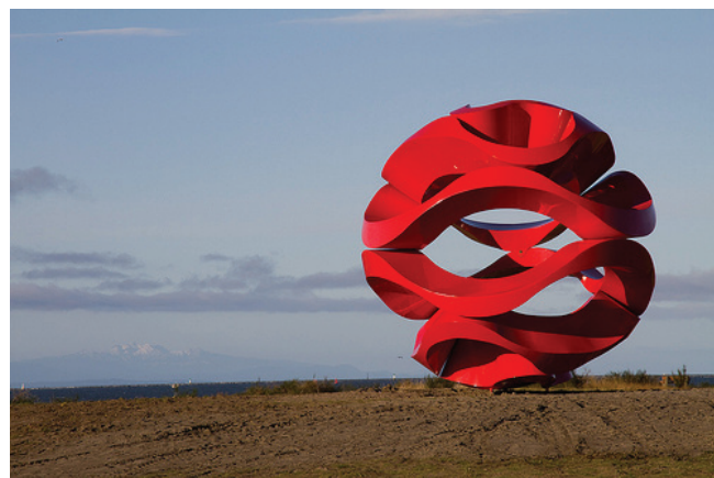
Olas de Viento (Wind Waves) , Yvonne Domenge, Garry Point Park, 2010