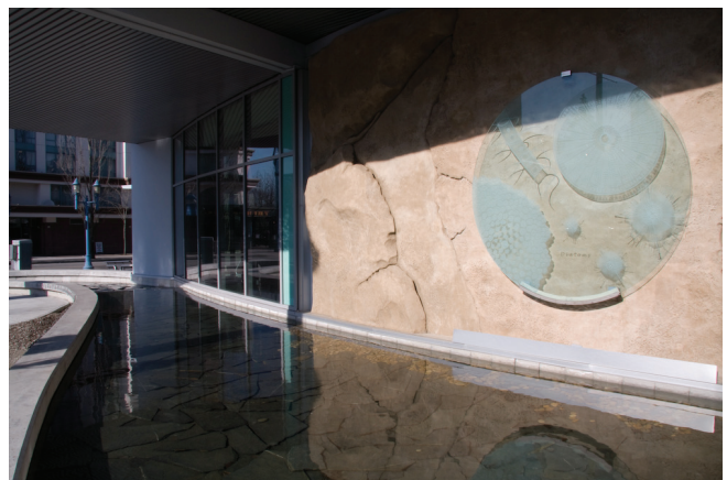
Still Water, Gwen Boyle, 2009