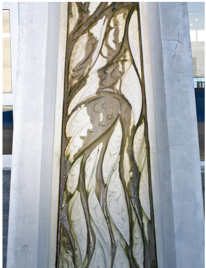
Buttress Runnels , Susan A. Point, 2009

A celebration of the completed artworks hosted by Mayor Brodie with artists Susan A. Point ( Buttress Runnels ); Buster Simpson ( Ice Blade ) and Janet Echelman ( Water Sky Garden ) was held on June 21, 2009, on the Legacy Plaza at the Richmond Olympic Oval. More than 200 attendees, including international visitors, came out to meet the artists and view the art.