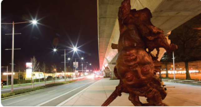
Cabezas (Heads) , Javier Main, No. 3 Road at Lansdowne Canada Line Station, 2010