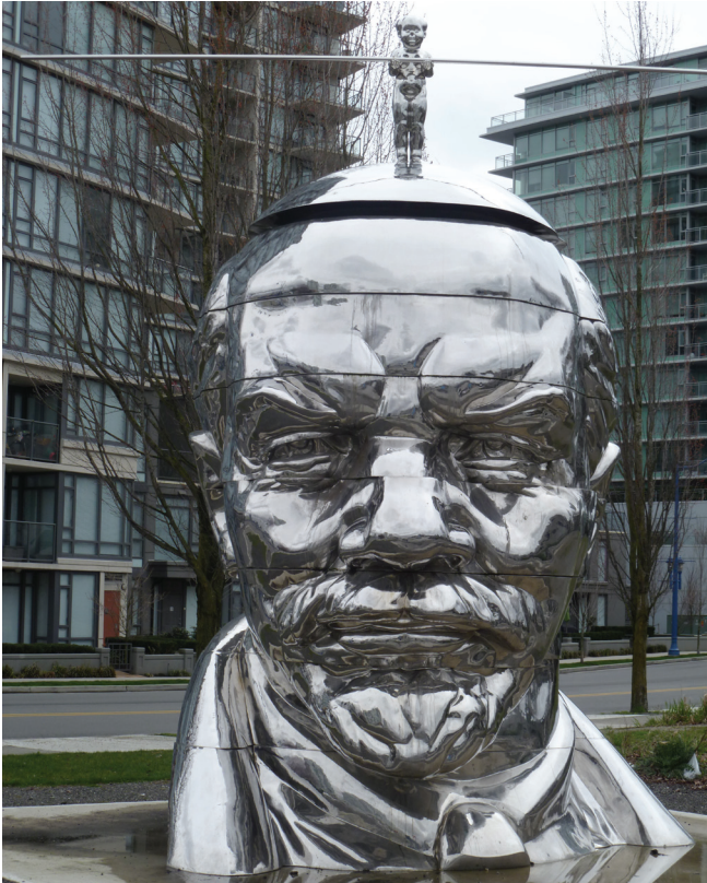
Miss Mao trying to poise herself on top of Lenin's Head, Gao Brothers, Elmbridge and Alderbridge Way, 2010