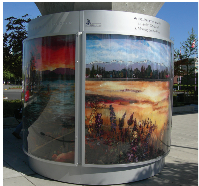
Richmond Landscapes, Jeanette Jarville, Lansdowne Canada Line Station Art Column, 2010