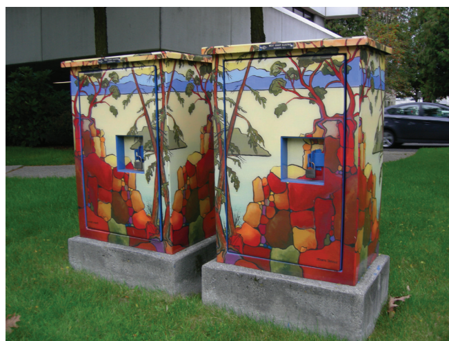
City Hall electrical kiosks Art Wraps, 2009

The civic public art projects completed in 2009–2010 have ranged from small scale improvements in the public realm, such as the Art Wraps program, to major works of public art at the Richmond Olympic Oval.