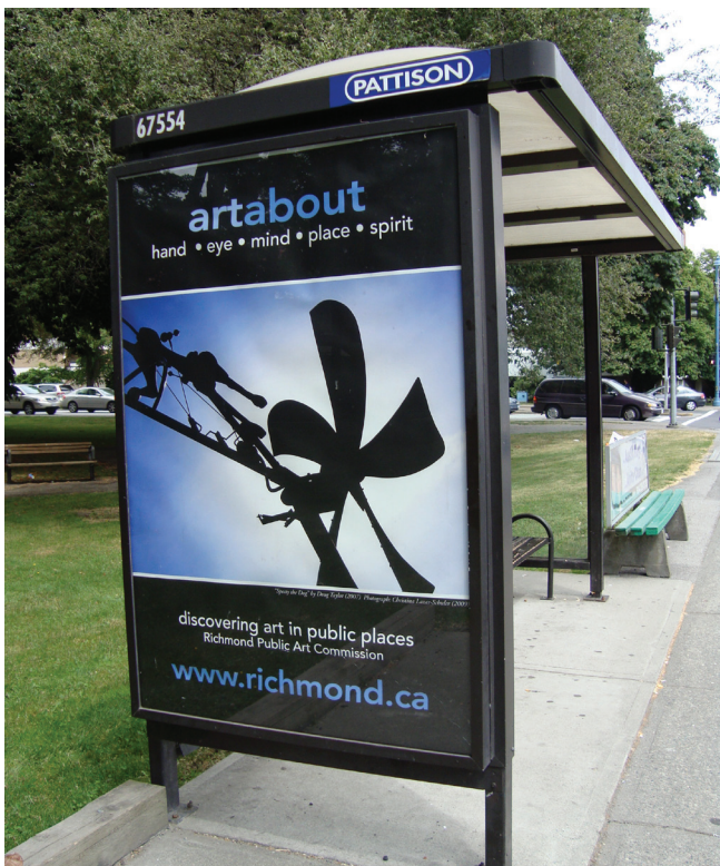
Discovering Art in Public Places, Transit Shelter Campaign, 2009

~Max Wyman, The Defiant Imagination , 2004