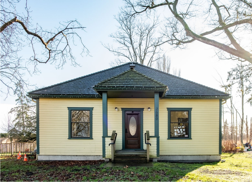
Figure 1. Terra Nova Nature School, 2680 River Road