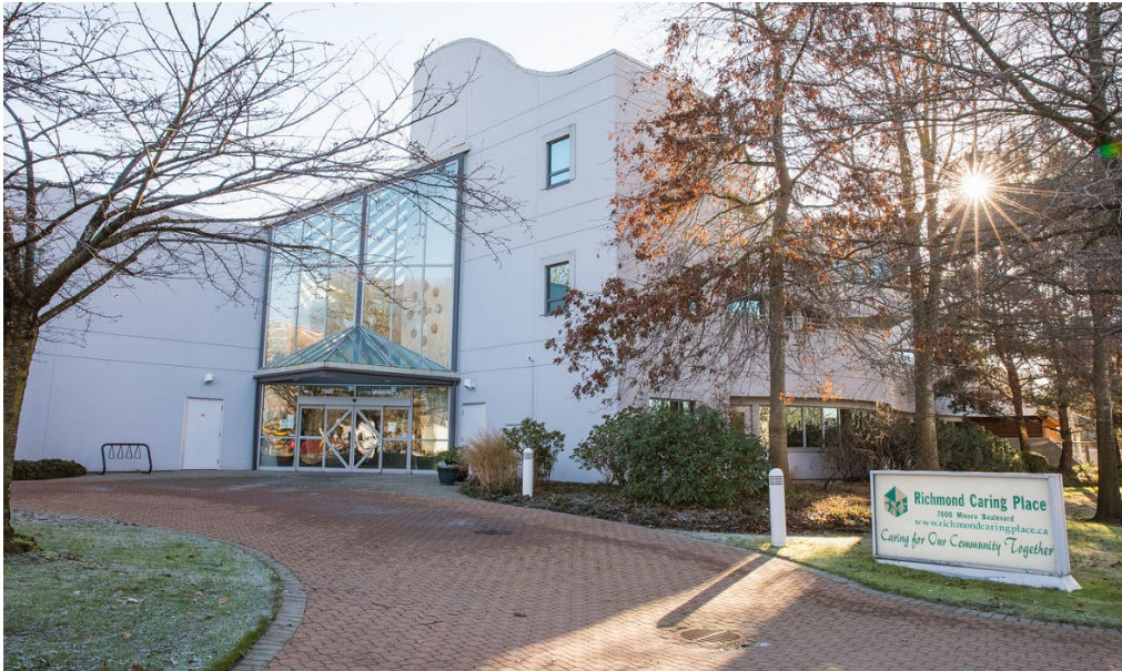
Figure 1. Richmond Caring Place / S.U.C.C.E.S.S.