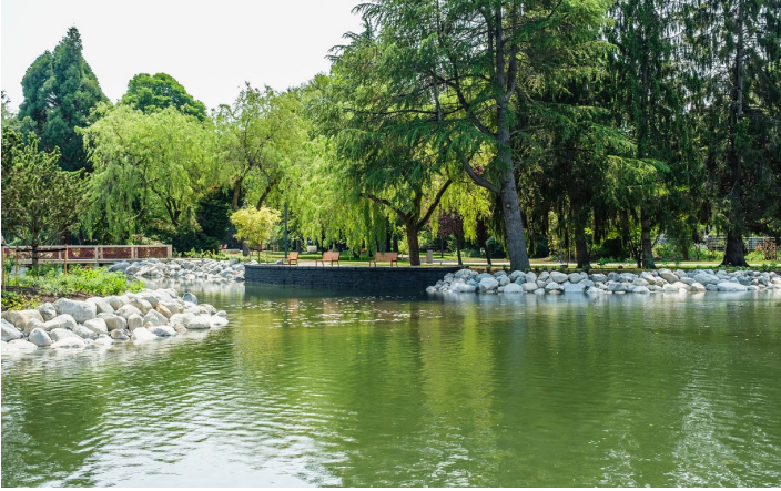
Figure 2. and 3. Minoru Park