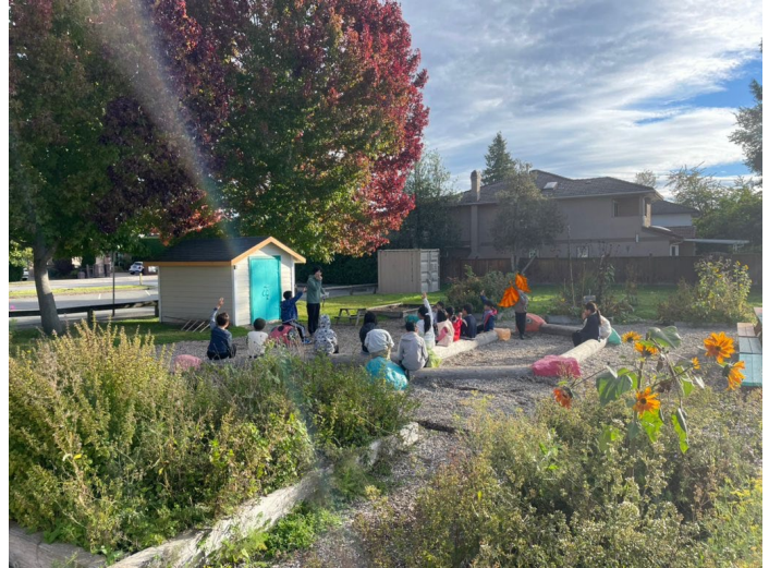
Figure 2 & 3. Jessie Wowk Elementary multipurpose gathering spaces. A new Outdoor Learning Space offers opportunities to explore and engage in a variety of materials to deepen understanding of, and relationship with, land and place.