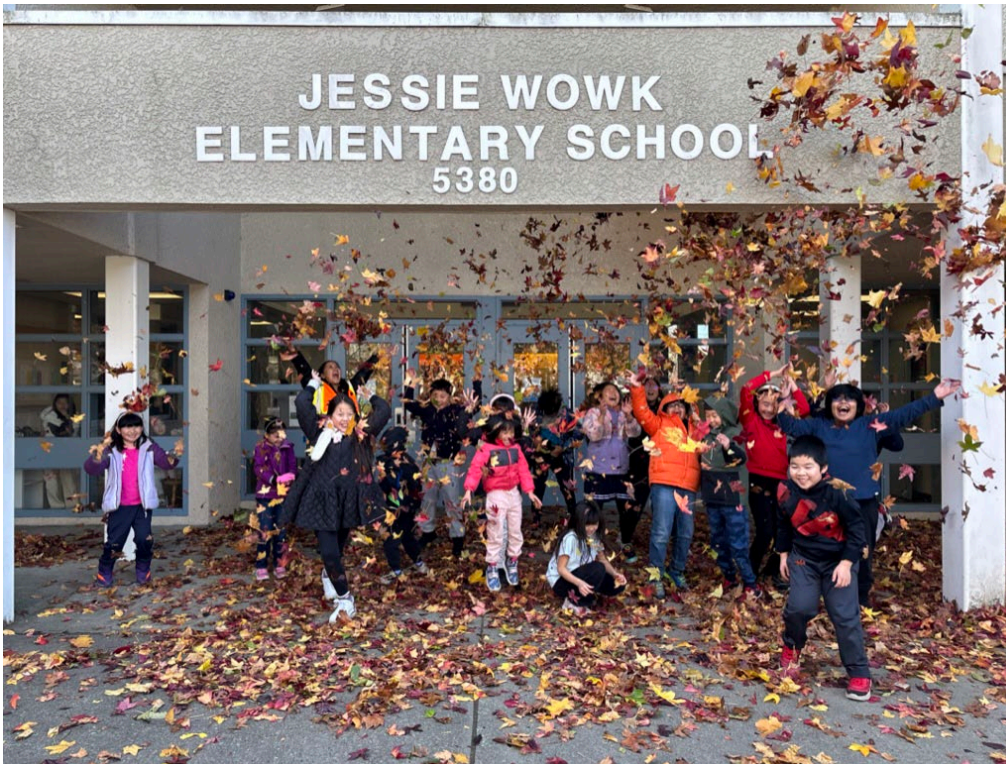
Figure 1. Jessie Wowk Elementary School.