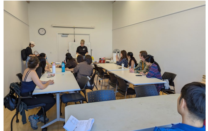
Figure 4. and 5. Richmond Caring Place Multi-Purpose Room and Richmond Cultural Centre Annex Butterfly Room