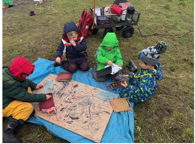
Figure 2 and 3. Terra Nova Nature School