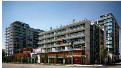
2 River Green