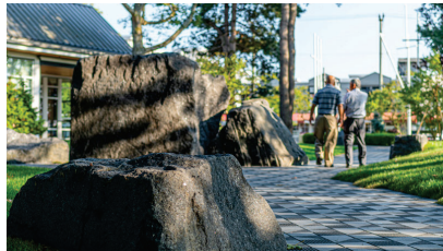
Steveston Nikkei Memorial