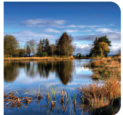
images: view from No. 3 Road, cranberry harvesting, Terra Nova Rural Park slough