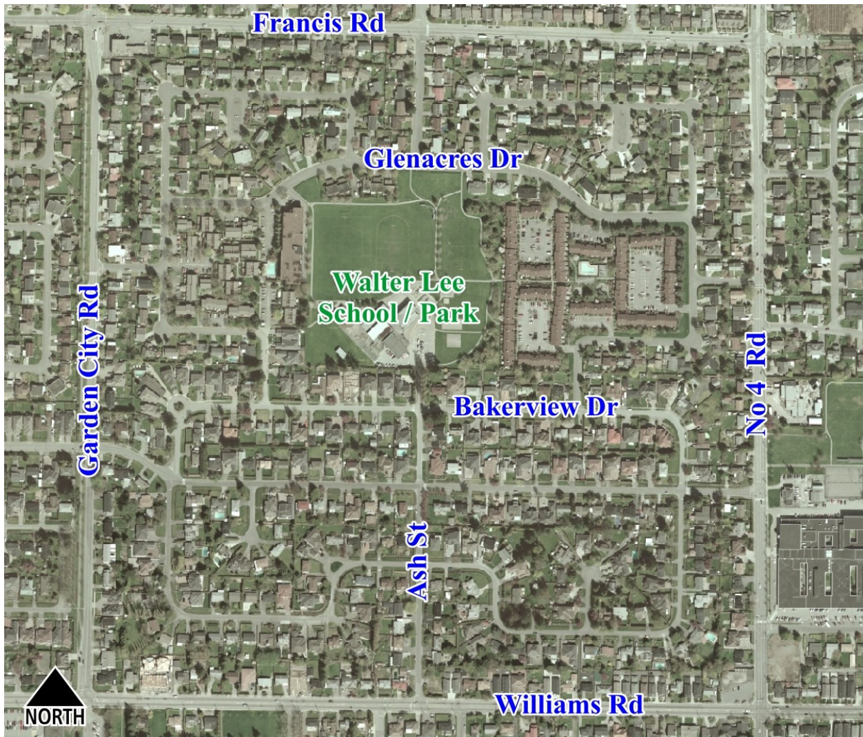
Figure 1: Walter Lee School Location

The perimeter of the new playground can fall within the approximate area indicated in Figure two (2). Bidders should work within this envelope, and should propose to use the minimum space necessary to properly accommodate the required play components and to appropriately fit the site.