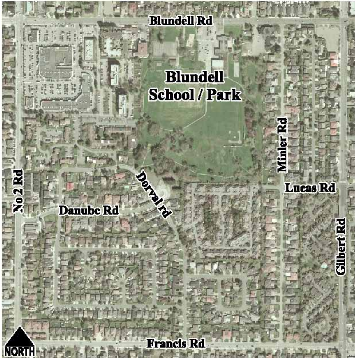
Figure 1: Blundell School Location