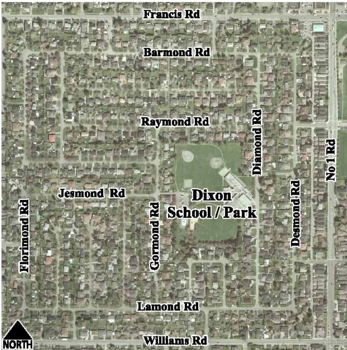
Figure 3: Dixon School Location