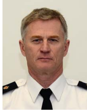
Malcolm D. Brodie Mayor, City of Richmond

A handwritten signature in black ink, appearing to read "Malcolm D. Brodie".