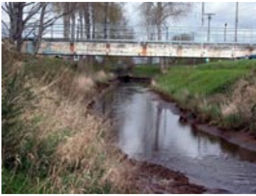
Canal and bridge at BC Ferries maintenance yard (No. 5 Road pump station)