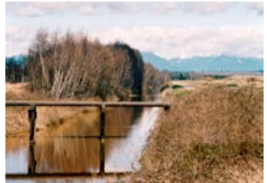
No. 7 Road Canal

The City is presently working with the Fraser River Port Authority in developing road and servicing agreements. Blundell Road will have a designated bike lane. In addition the City produced a working document, “ Open Space Amenity Guidelines Fraser Lands Port Amenity Zone ”, to use for discussion with the Port about the trails and park needs for the area. Nelson Road is being upgraded in two phases. The second phase will allow for pedestrian trails. The GVRD Parks Department is working with the City on the concept of an aqua ferry at the end of No.5 Road to connect Ladner and Richmond. Translink operates a shuttle bus service through the tunnel for cyclists and pedestrians.