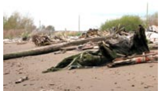
Waterfront east of No. 7 Road