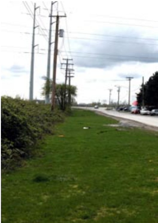
No. 5 Road ditch in-fill