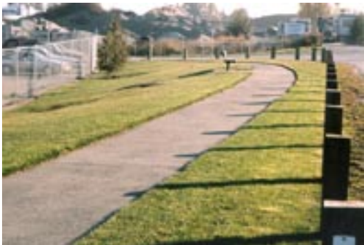
South Dyke at No. 5 Road