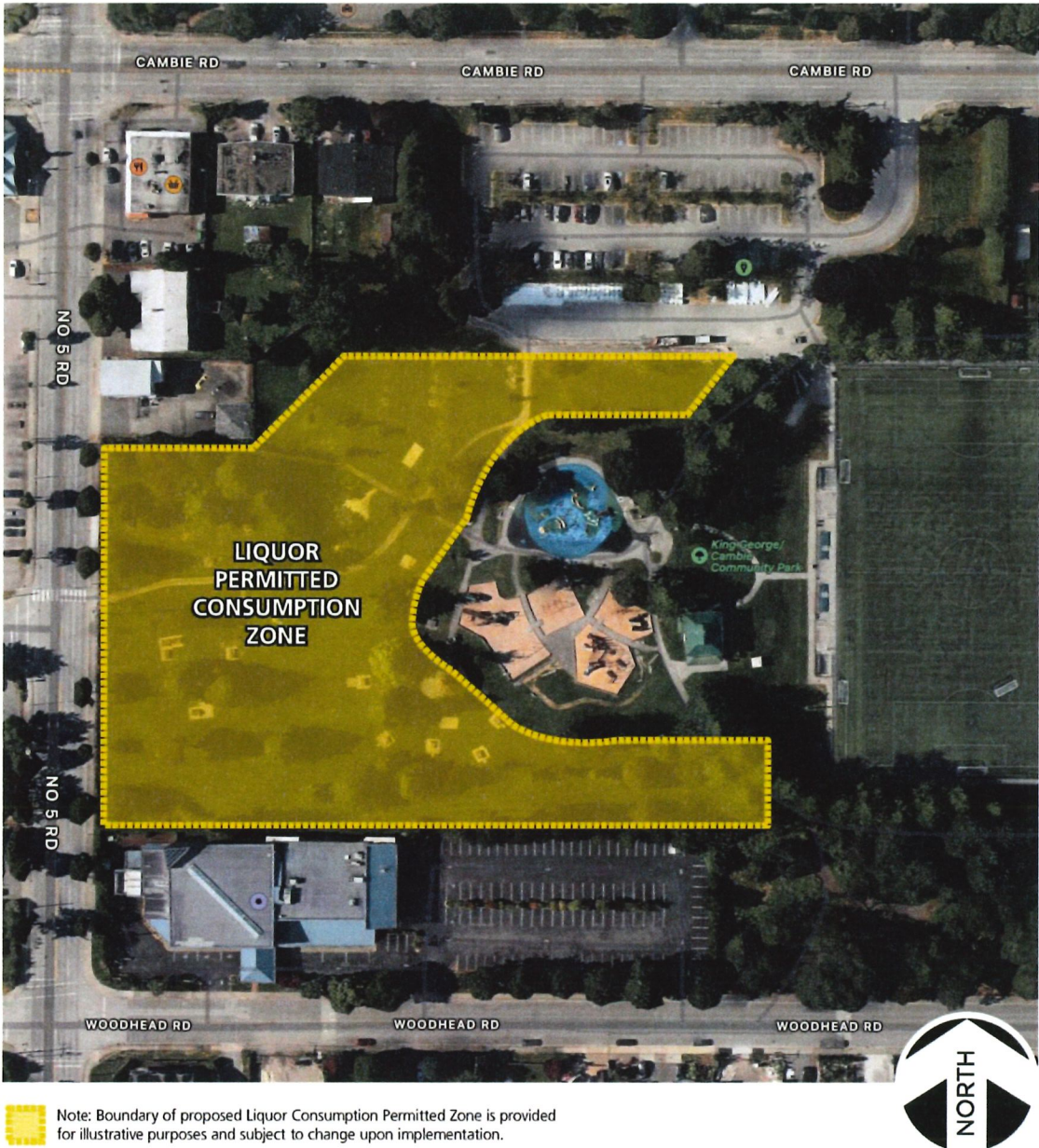
King George Community Park