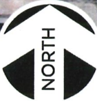
Garry Point Park