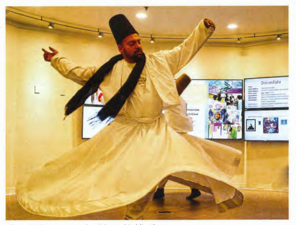
Islamic Art Experience at the Richmond Public Library. CSBL - 40