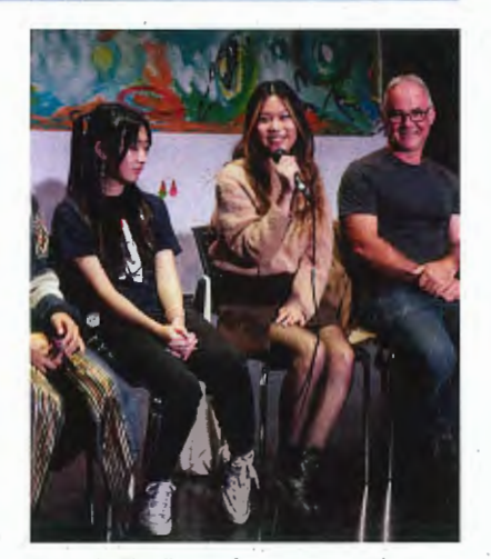
Mosaic Firefly performance at the Richmond Cultural Centre.