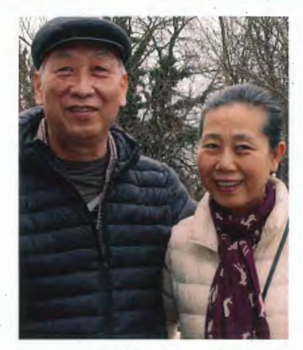
Richmond residents featured in the Newcomers Video Series.