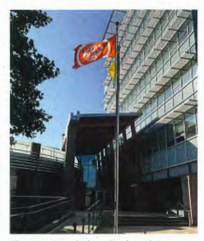
The Survivors' Flag displayed at Richmond City Hall.