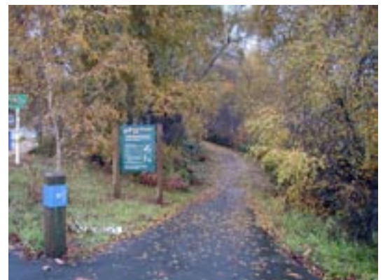
Link to Nature Park