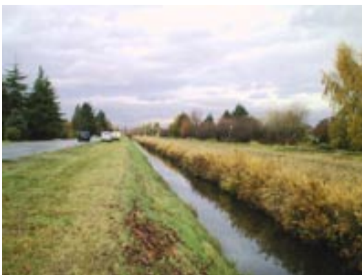
North of Steveston Hwy.