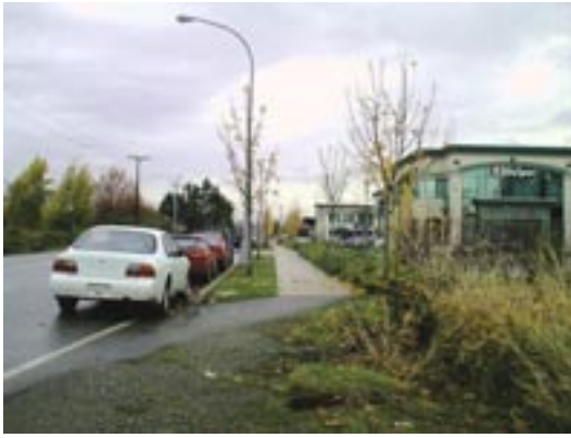
North of Bridgeport Road