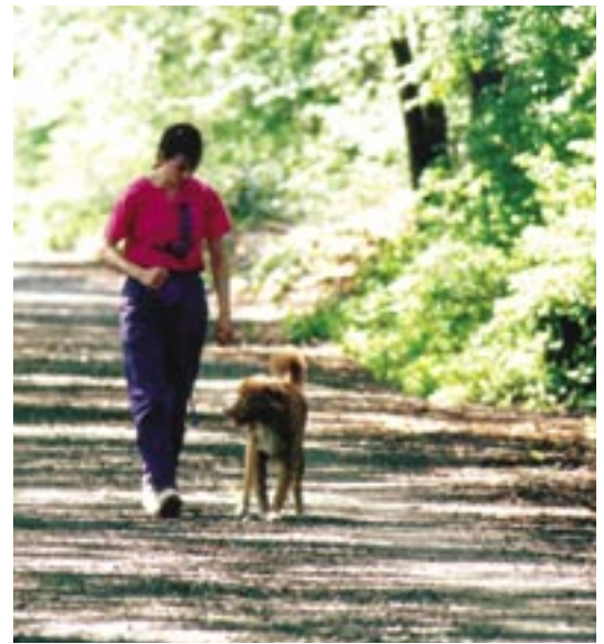
Shell Road Trail between Westminster Hwy. and Athabasca Drive