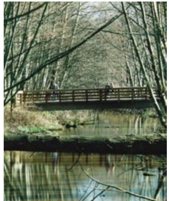
Horseshoe Slough Trail