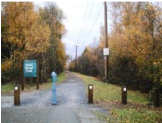
North of Athabasca Drive