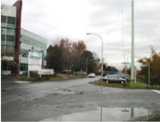
North of Cambie Road