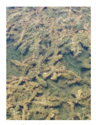
Brazilian Elodea in Steveston Slough, West Dyke