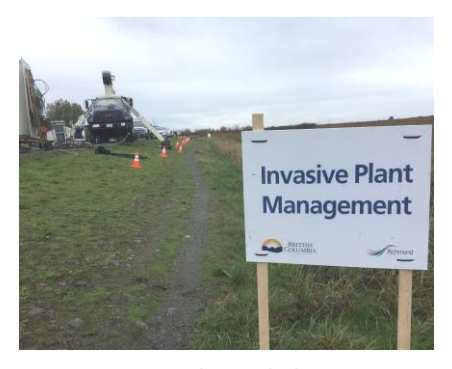
Partnership with the Province of BC on Brazilian Elodea removal