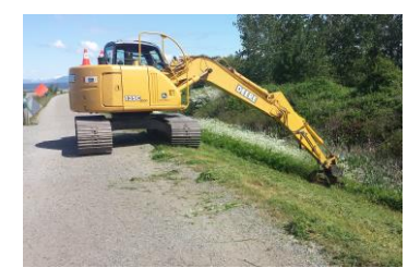
Wild chervil mowing trials along West Dyke