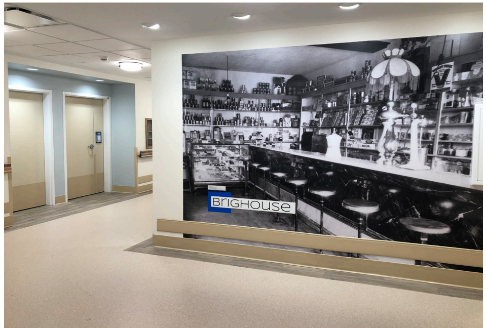
Hamilton Village Care Centre.