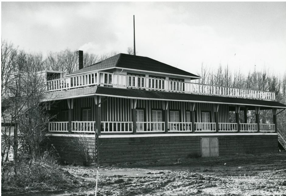
The clubhouse at Minoru Park, which stood near the site of the present Archives, was used as a temporary hospital during the 1918 epidemic.

(The sources used are the reports from the Chief Medical Officer, captured in the Township of Richmond Council Meeting Minutes, and the Minutes of the Richmond School Board.)