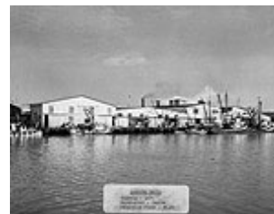
Paramount Plant, 1960s