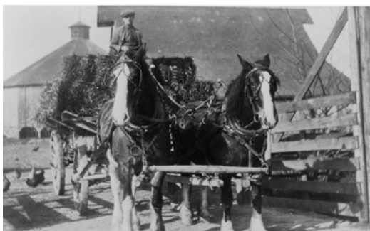
A team and wagon underway with the Ewen Barn (also known as Keur Barn) in the background, ca. 1900.

The newsletter also reports on new online resources added to the Archives’ web site, recent acquisitions at the Archives, summer events, and this year’s Friends of the Richmond Archives’ annual Archives Tea.