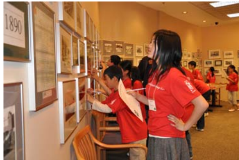
Richmond-Delta Heritage Fair participants take on the Archives' "Timeline Challenge."

The City of Richmond Archives was a venue for young people this spring and summer as part of the Richmond-Delta Heritage Fair in May (organized jointly by the Richmond Museum and the Delta Museum and Archives) and with the Richmond Museum's Time Traveller Day Camp in July and August. Through these programs, 133 young people were introduced to the resources available to them at the Archives.