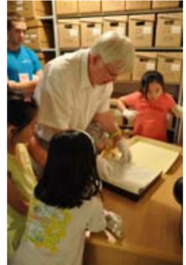
Richmond "Time Travellers" tour the Archives and discover treasures in the vault.