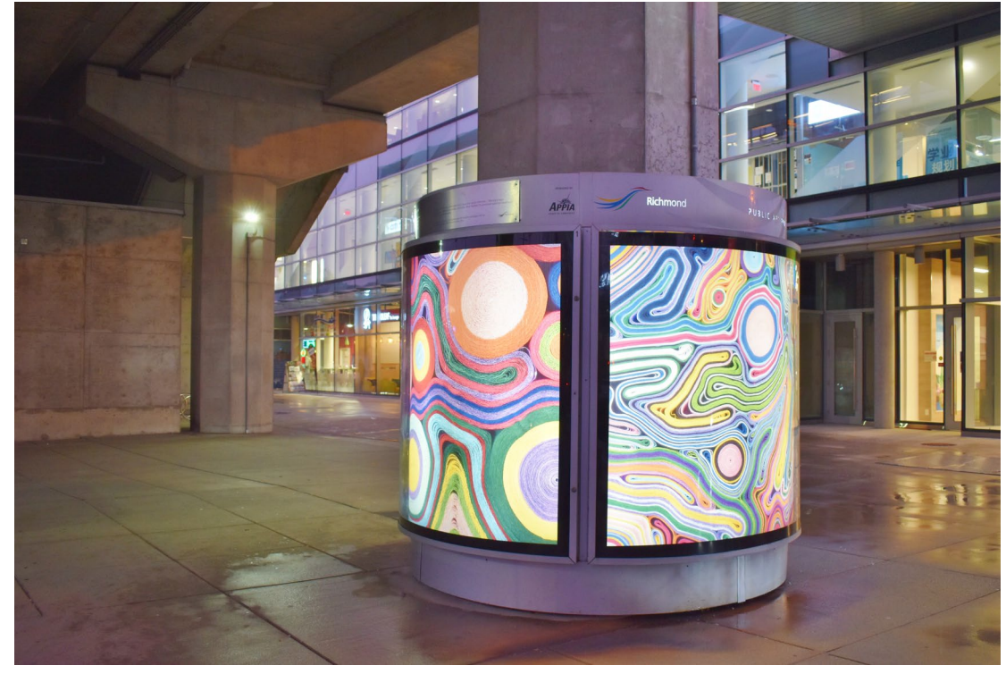
Figure 3. No. 3 Road Art Column at Aberdeen Canada Line Station. Adriele Au, 2022.