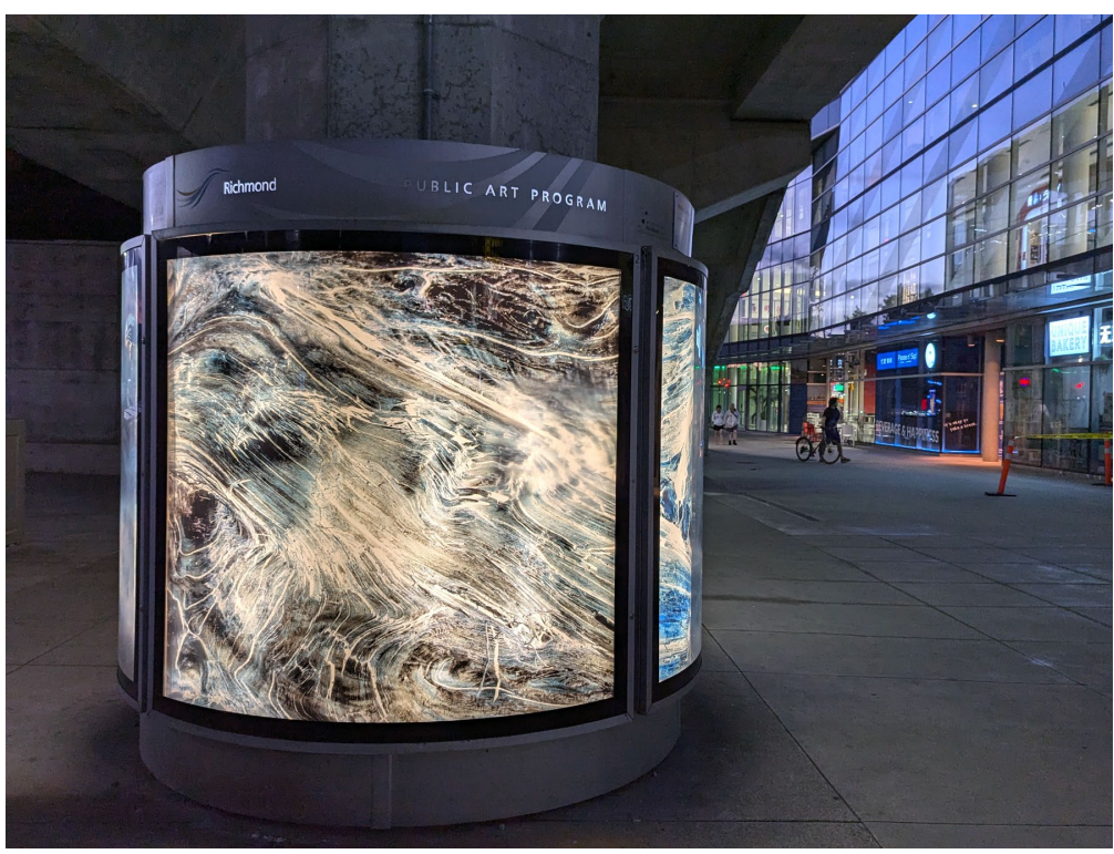
Figure 1. Drift WoodScapes: Blue Views, Maria Coletsis, 2024. Aberdeen Canada Line Station.