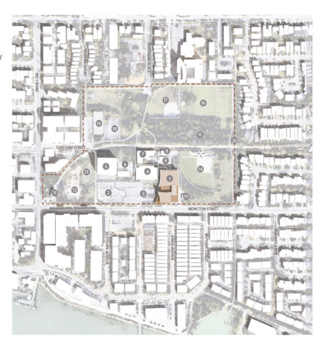
Figure 3. Steveston Community Centre and Library site plan