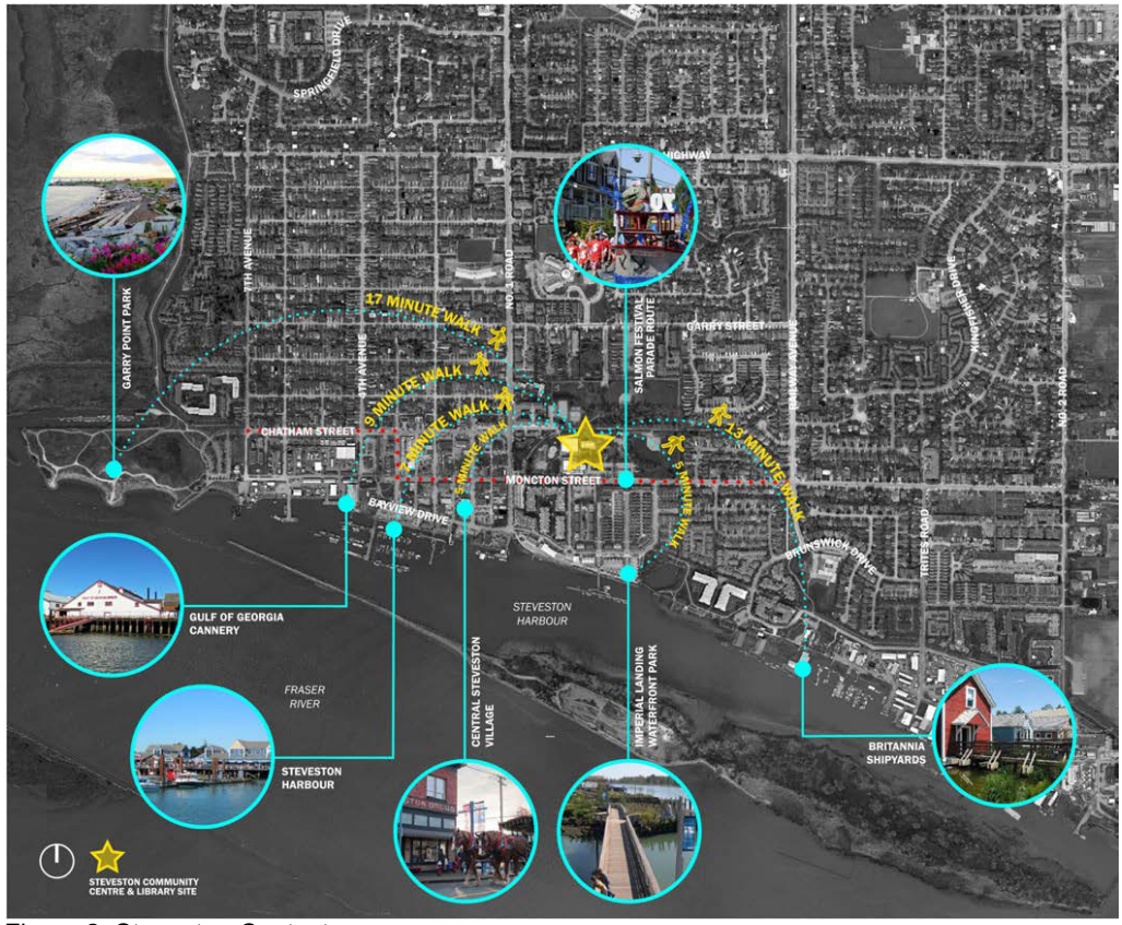
Figure 2. Steveston Context

Steveston has many significant human history and natural attractions that give the community a distinct sense of place, and the Steveston Community Centre and Library site is at the geographic centre of it all. The Gulf of Georgia Cannery, Garry Point Park, Imperial Landing Waterfront Park, and other major community amenities are within a short walking distance of Steveston Park. (Figure 2)