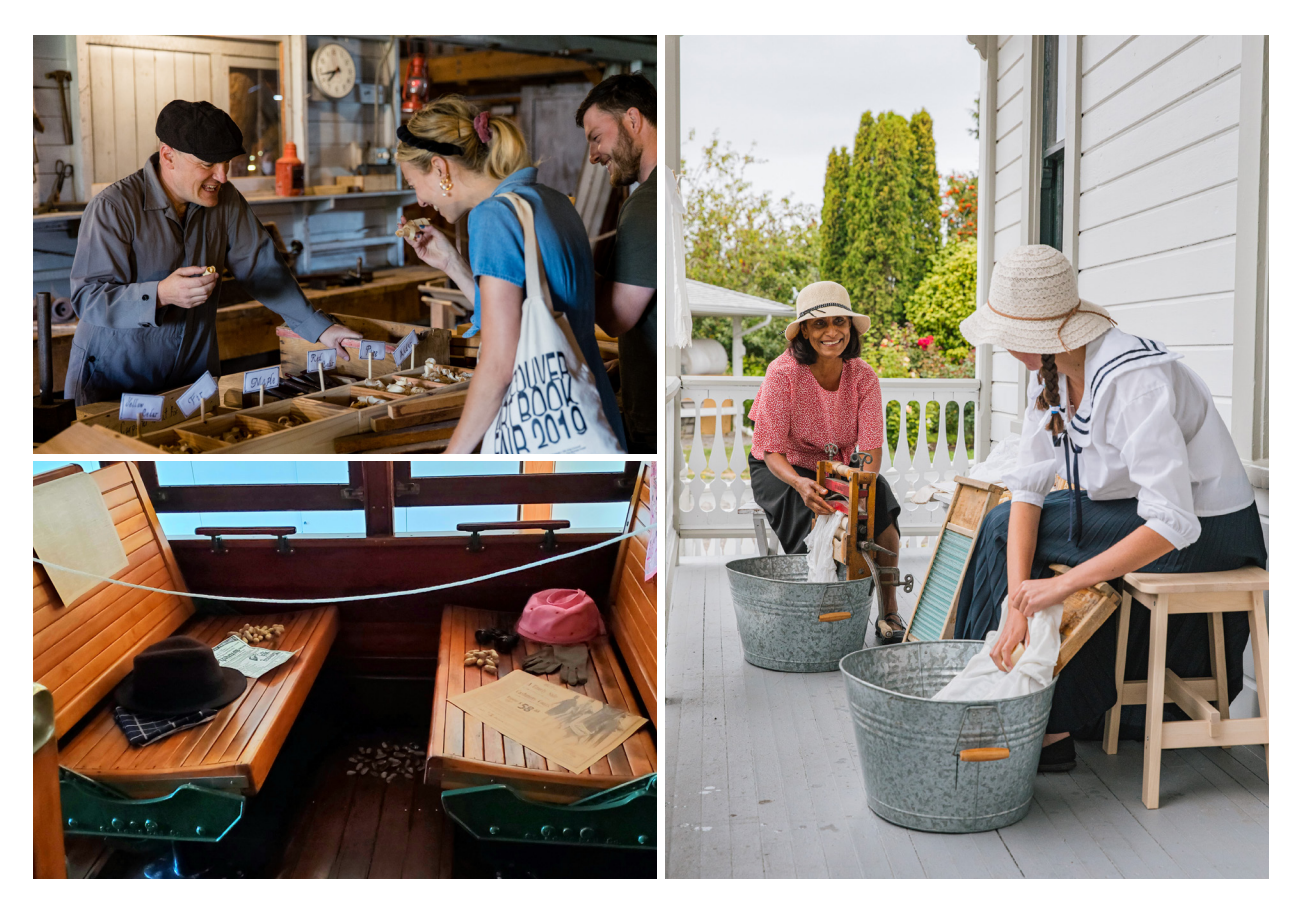
Images, top to bottom, left to right: Wood working displays at Britannia Shipyards, Tram passenger display, Doing laundry at London Farm

This story is primarily told at the Steveston Tram with supporting interpretation at the Steveston Museum and Post Office and London Farm.